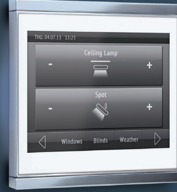
Corlo Touch KNX