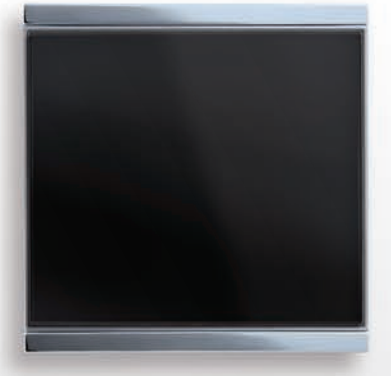
Corlo Push Button M1-T, glossy