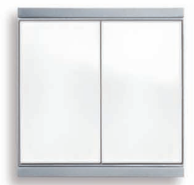
Corlo Push Button M2-T, matt

Elsner Elektronik GmbH, D-75391 Gechingen www.elsner-elektronik.de