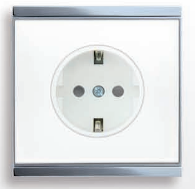
Corlo Power Outlet, glossy