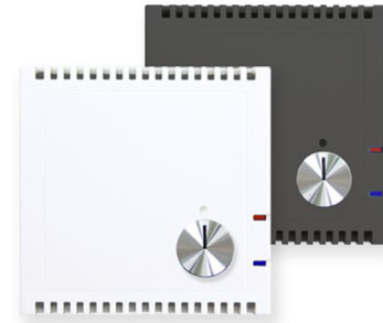
SK30-TC-R white / anthrazit