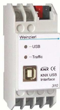
Figure 1: Photo of device

This interface is for establish a bidirectional connection between a PC and the EIB/KNX installation bus. The USB connector has a galvanic separation from the EIB/KNX bus. Both ETS (Engineering Tool Software) versions ETS3 or later and some Visualization tools support this interface.