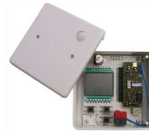
Fig. 3: KNX ENO 610

Select an installation location that lies within the range of the EnOcean sensors that will be used with the device. Avoid shielding objects (e.g. metal cabinets) and sources of interference (e.g. computers, electronic transformers, ballasts) near the gateway.