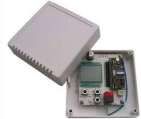
Fig. 4: KNX ENO 612

Detailed information on coverage planning and RF penetration can be found in the sensor data sheets.