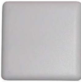
Fig. 1: KNX ENO 610