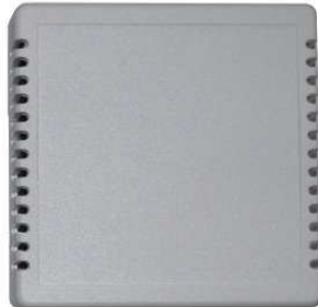
Fig. 2: KNX ENO 612